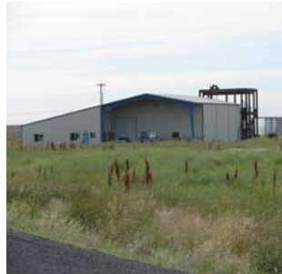
Columbia BioEnergy Facility in Creston, Washington

Columbia BioEnergy is now employing 10 people at family wages. It is using the PCC Railroad to import the soybean oil.