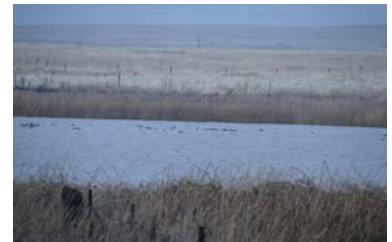
Audubon Lake in Reardan, WA.

chase the land. The PDA just submitted a USDA grant application.