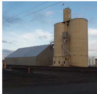
Future site of IEO—Oilseed Crusher & Biodiesel Refinery

The Odessa Public Development Authority has partnered with Inland Empire Oilseeds, LLC to build the first large scale canola seed crushing facility in the Pacific Northwest. Once the crusher is completed, the facility that will be located inside the Odessa city limits, will expand to refine its oil into biodiesel.