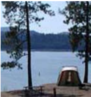
Lake Roosevelt offers camping, boating and hiking

The opportunities for growth and prosperity in Lincoln County are endless. Affordable land, upgraded infrastructure, good schools and safe communities all located in a rural setting with the Lake Roosevelt National Recreation Area as its playground.