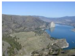
Aerial view of Whitestone Rock at Lake Roosevelt

In 2001, Walter and Judy decided to branch out and use their grapes to make their own wines and what a success that