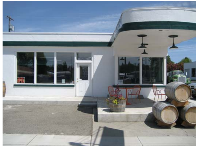
Whitestone Winery and Tasting Room in Wilbur, Wa. Open Fri & Sat 11 a.m. to 5 p.m. www.whitestonewinery.com

has been! In the Fall of 2005 the Whitestone Winery and Tasting Room was opened in Wilbur and for the first time not one grape was exported outside of Lincoln County!