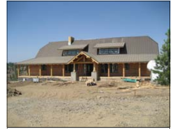
Hawk Creek Estates Club-house under construction